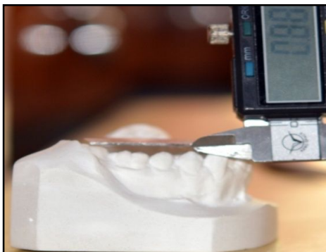
Figure No. 1: Measuring curve of Spee

The depth of curve of Spee was measured as described by Al Qabandi et al. It was measured as perpendicular distance between the deepest cusp tip and a flat plane that was laid on top of the mandibular dental cast, touching the incisal edges of the central incisors and the distal cusp tips of the most posterior teeth in the lower arch. The measurement was made on both side and the mean values of these two measurements were used as the depth of curve of Spee.