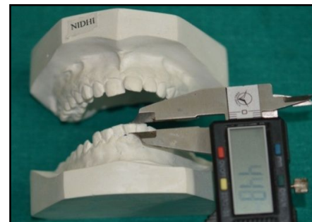
Figure No. 4: Measuring the overbite