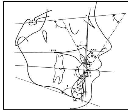
Figure No. 2: Diagrammatic representation of angular and linear measurements taken on lateral cephalogram.

Following linear and angular measurements were taken:-