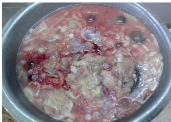
Figure No. 4: Evacuated Hydatid cysts with daughter cysts