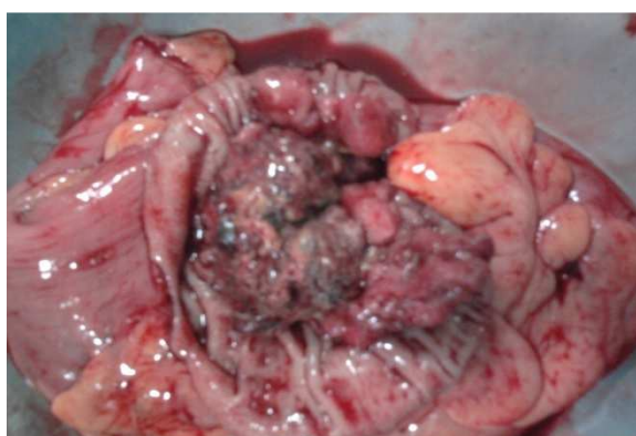
Figure No. 3: Intraoperative picture showing retroperitoneal large cavity with daughter cysts